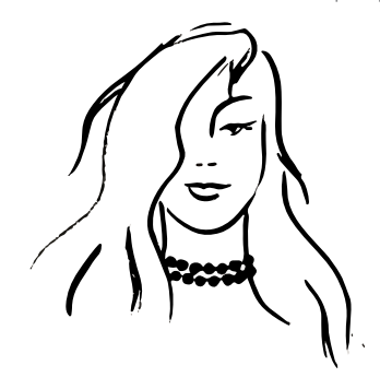
ca. 30 - 33 cm / 12 - 13 inches

Swarovski have drawn a number of illustrations to demonstrate a selection of looks highlighting the varying ranges of necklace length. This has been designed to help you better envisage what your next favourite piece will look like. The model's proportions correspond to approximately 169 cm/5 ft 5 in.