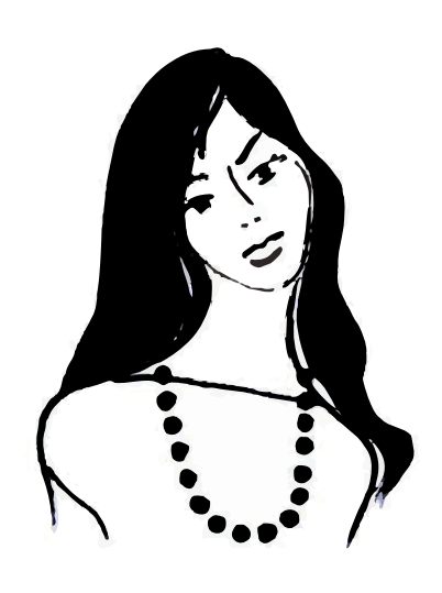
ca. 50 - 62 cm / 20 - 24 inches