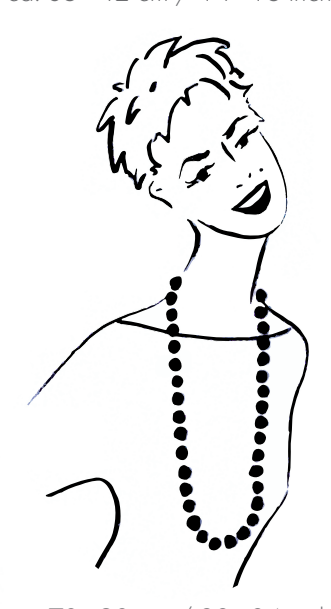
ca. 70 - 90 cm / 28 - 34 inches