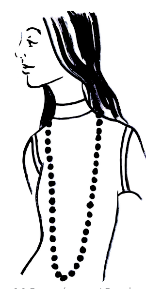
over 115 cm / over 45 inches