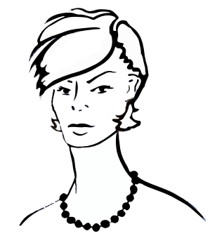
ca. 43 - 50 cm / 17 - 19 inches